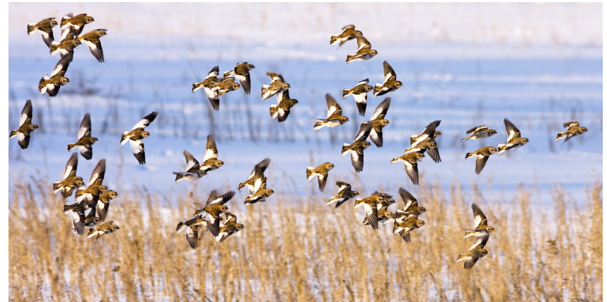
Snow Buntings visiting the park

Irving & John Anderson County Park encompasses 174 acres and was added to the Isanti County Park system in 2007. It typifies the Anoka Sand Plain region consisting of northern hardwood forests, restored prairies, wetlands and lakes. The park protects one half mile of undeveloped shoreline along Horseleg and Horseshoe Lakes.